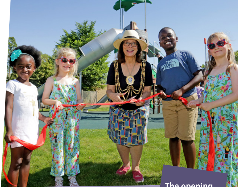
The opening ceremony at Carden Park

The refurbishment has been funded by Section 106 developer contributions and is the latest completed as part of a £3 million package of playground improvements across the city.