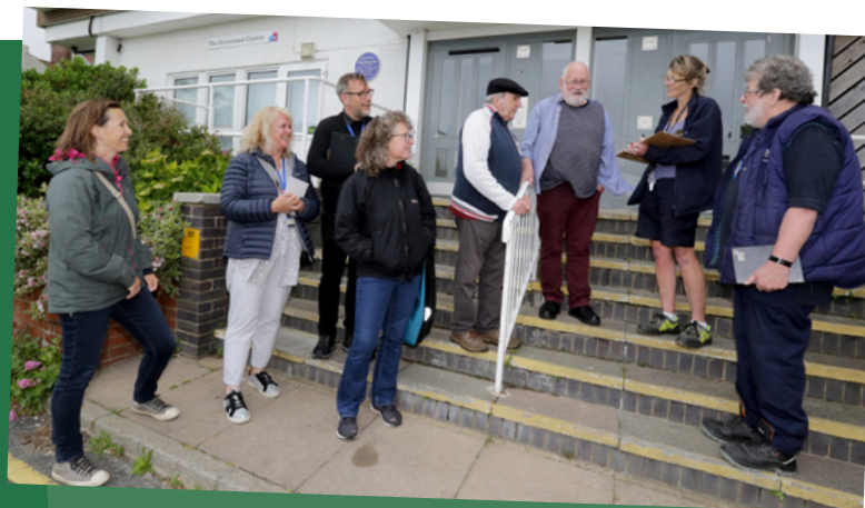
An Estate walkabout at Tyson Place earlier this year

The Wellington Road walkabout brought people together who asked for support in restarting their tenant and resident association, and the Community Engagement Team will be setting up a meeting to get this going.