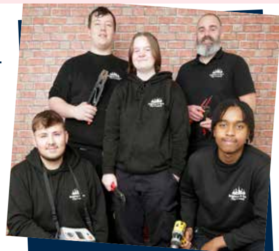
Some of our apprentices