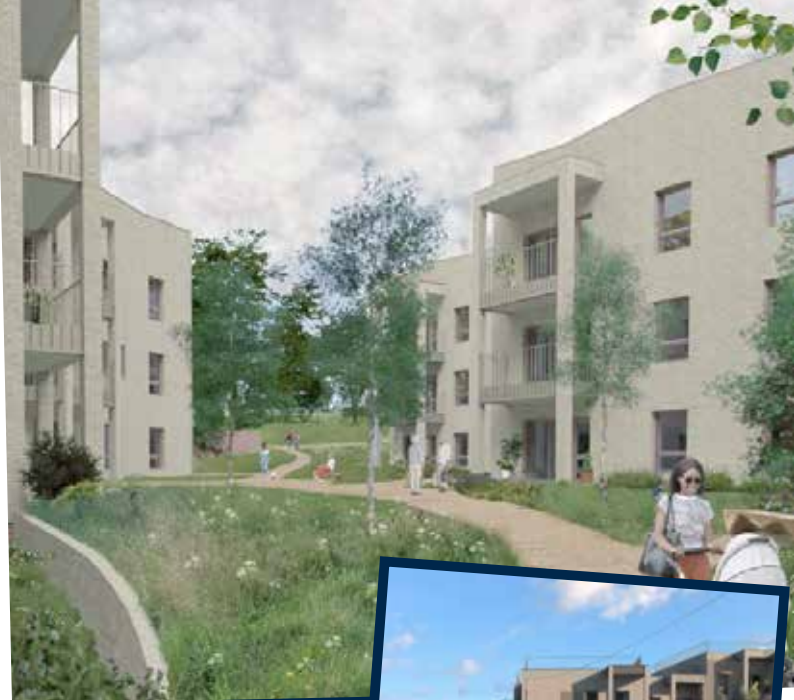
Images of proposals for Portslade Village Centre (above) and Windlesham House (right)