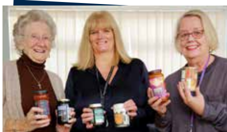
Collecting groceries for a food bank

Gardens in 1987 and has lived there the longest. She said: "It's a nice little community here and the 50th anniversary is definitely something to celebrate!"