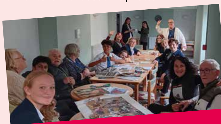
'With Age Comes' project bringing students and seniors together

These were used to create artworks and printed onto T-shirts, providing a great talking point and a chance to chat about the photos.