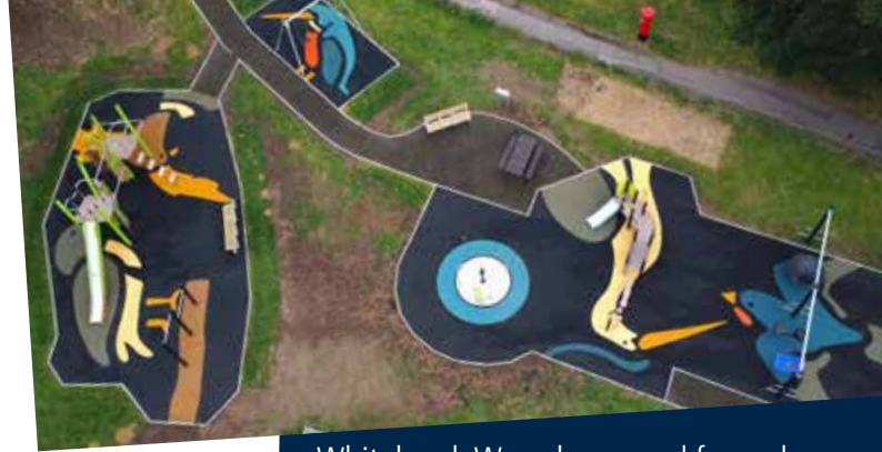
Whitehawk Way playground from above