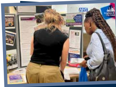
Sharing ideas and information at the conference

Themes this year included improving open spaces on council estates, and residents from 3 local groups gave inspiring presentations about community projects making a difference in their areas.