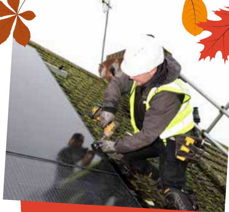
Installing solar panels on a council home

The council is working in partnership with EDF on this project, called Sunshine Saver, and successfully bid for funding from the Department of Energy Security & Net Zero to install the batteries.