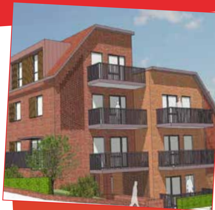
Plans for Carden Hill, Hollingbury