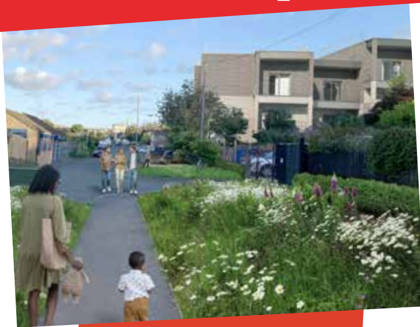
Plans for Windlesham House, Portslade