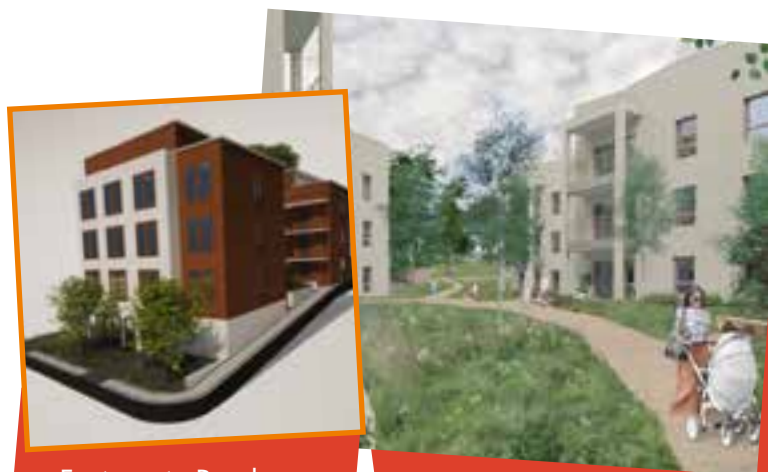
Eastergate Road, Moulsecoomb

For more information, visit www.brighton-hove.gov.uk/nhfn