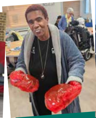
Dress as a Brightonian bingo