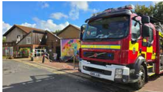
A fire crew at the celebration day