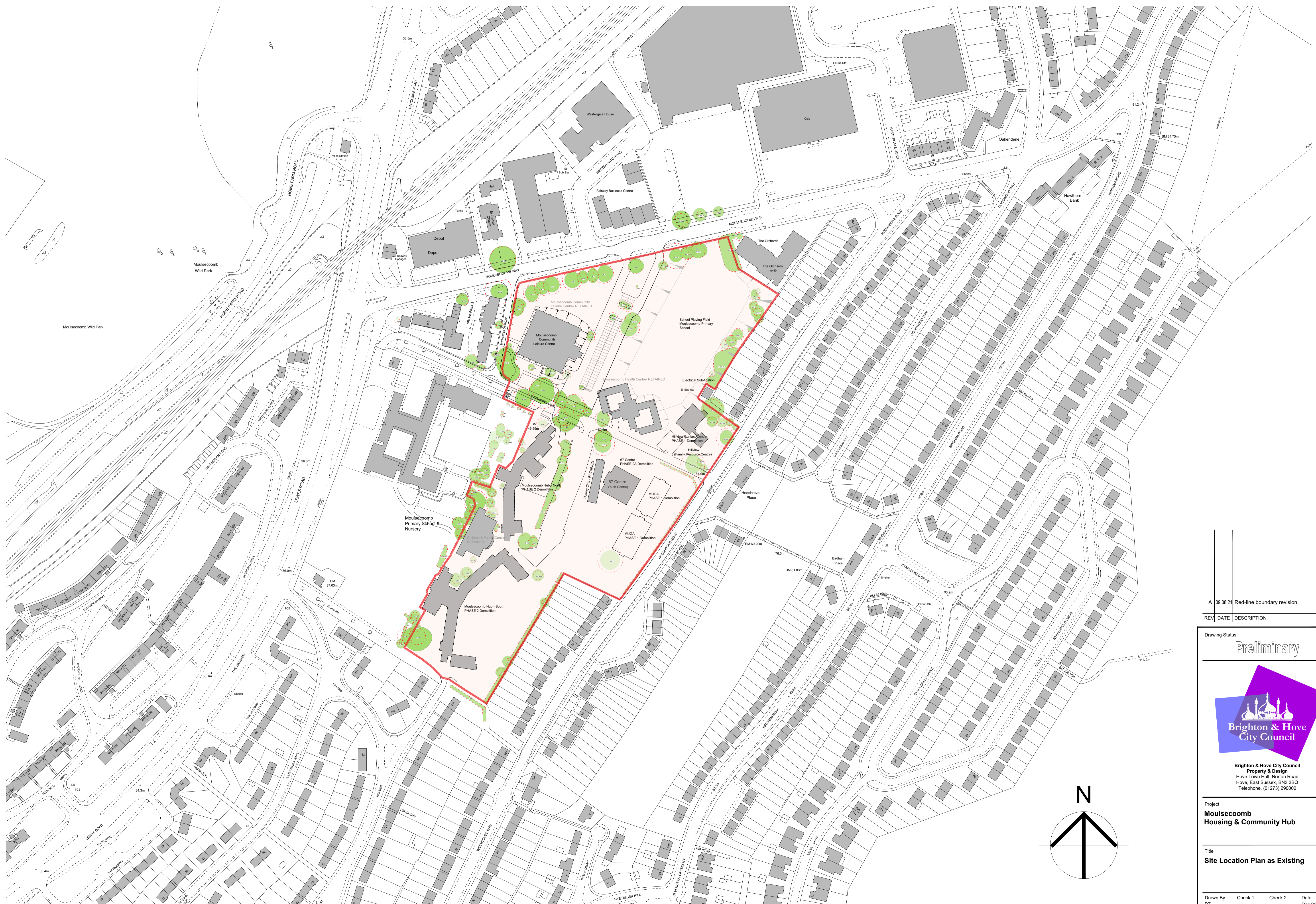
Site Location Plan- As Existing Scale 1-1250 @A1